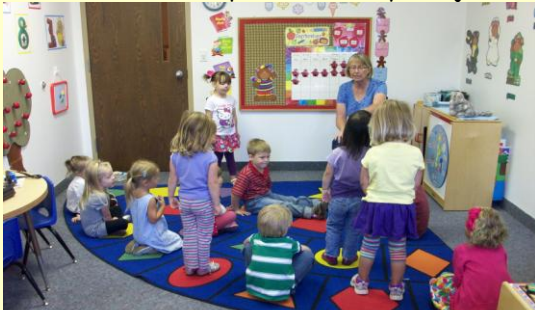
Rocking group with the T,TH Class!