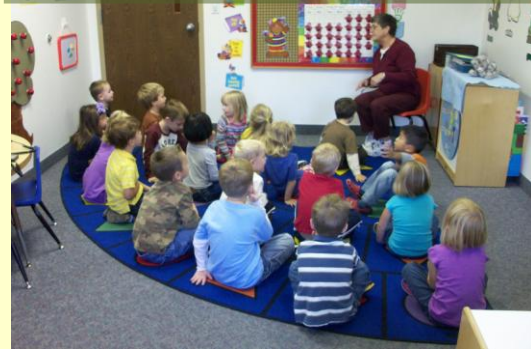
M,W,F morning group at its best!